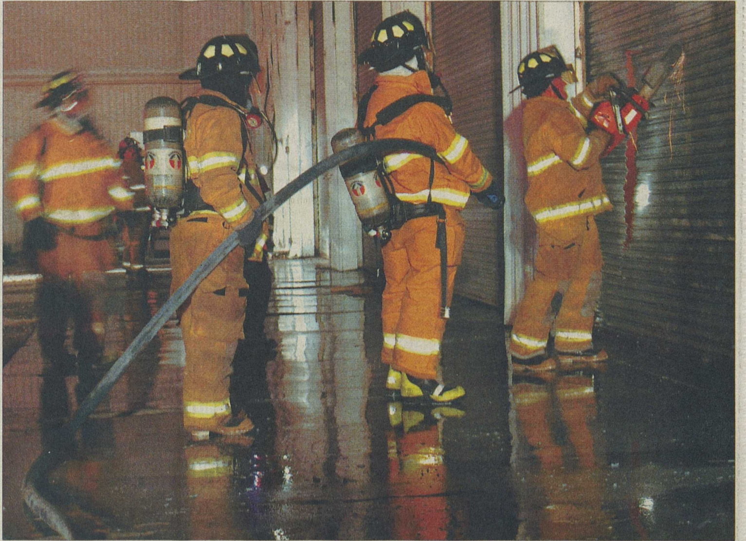
Firefighters work to cut open a door in the building at Hanover that caught fire on Sunday evening. See story on page 1.

Goins said the plant employs about 250 people and manufactures equipment for oil field services.