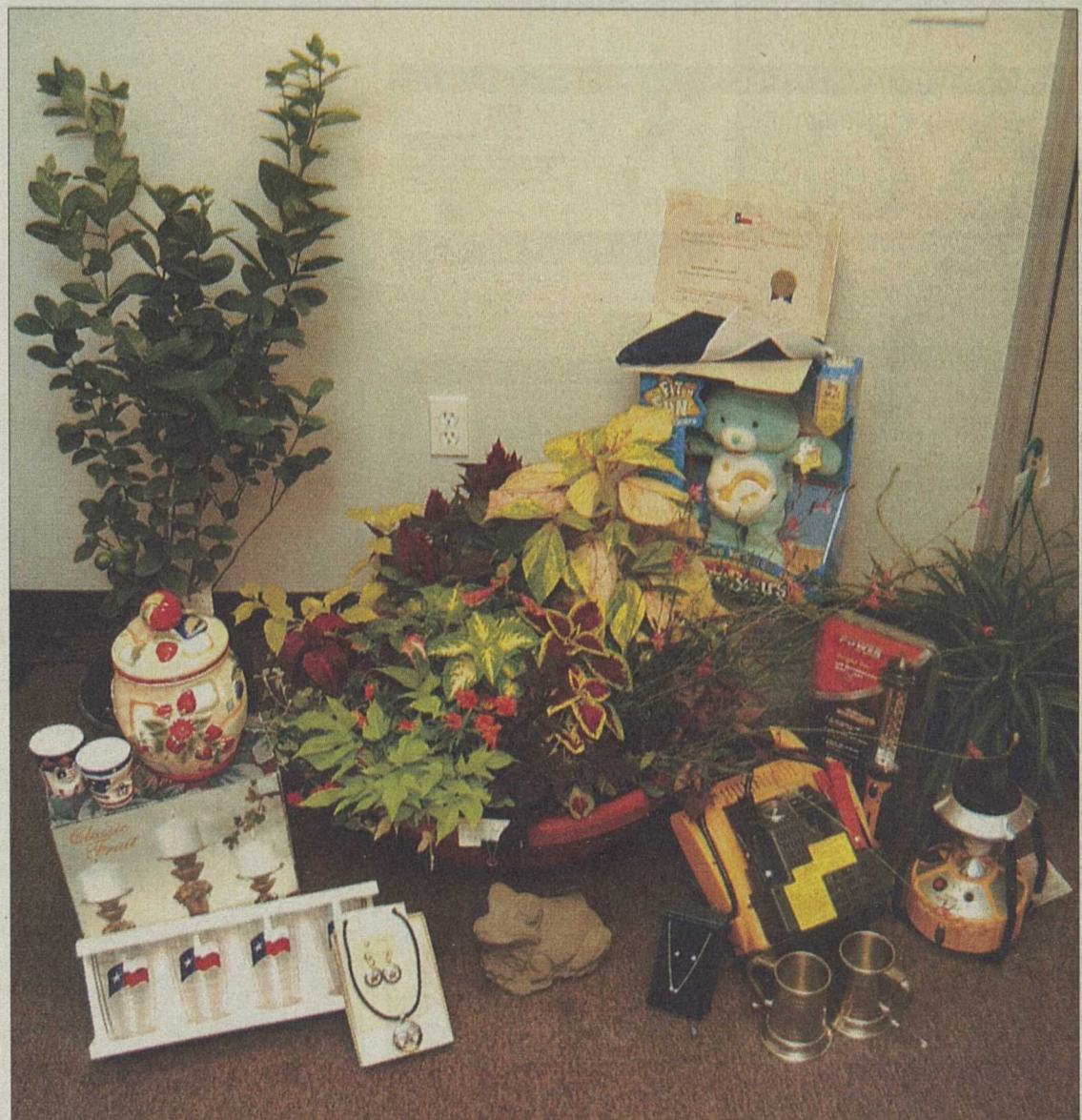
Pictured above are more items that will be available in the silent auction at the Eagle Lake Peace Officers Equipment Fundraiser on Thursday night at the Community Center.

Click On Your Headlight! www.eaglelakeheadlight.com